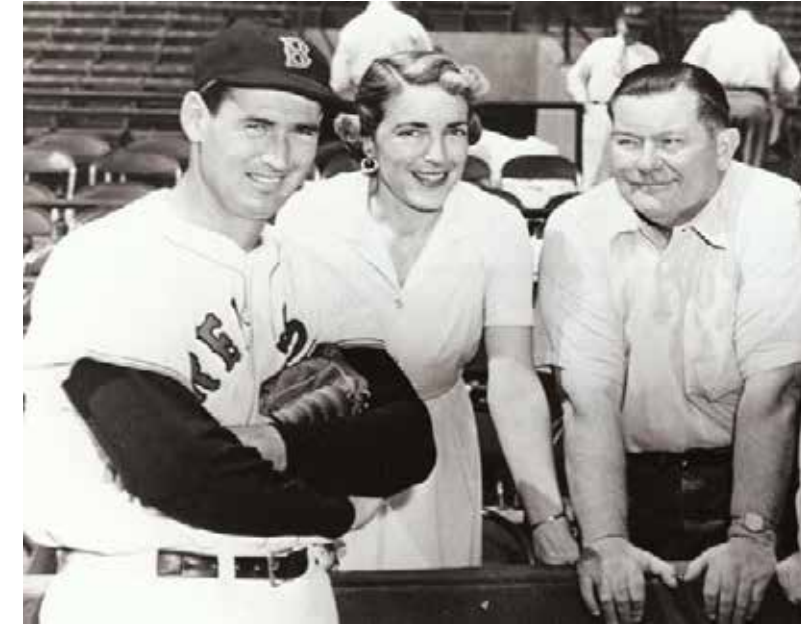
The Yawkeys with Ted Williams at Fenway Park (1953)

The Cape Cod Baseball League extends its deepest gratitude to the Yawkey Foundation for more than 30 years of unwavering support.