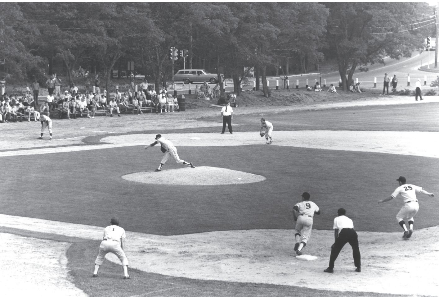
▲ Action from the 1967 Cape Cod League All-Star game at reconfigured Eldredge Park