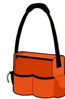
MEDICALLY NECESSARY ITEMS INCLUDING DIAPER BAG