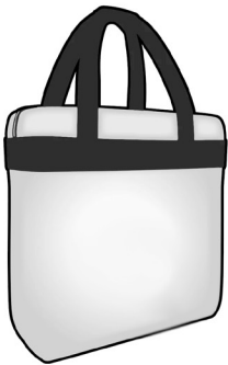
CLEAR PLASTIC BAG NO LARGER THAN 12" X 6" X 12"