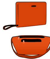
FANNY PACK OR CLUTCH PURSE NO LARGER THAN 5" X 7"