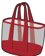
OVERSIZED TOTE BAG