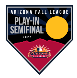
Friday, November 11 Peoria Sports Complex