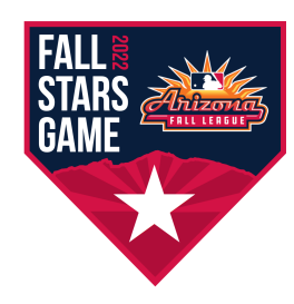
Sunday, November 6 Sloan Park