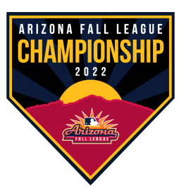
Saturday, November 12 Scottsdale Stadium