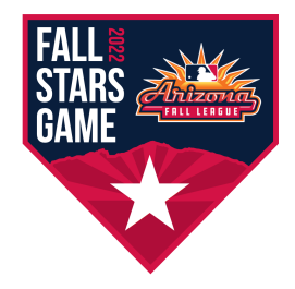
Sunday, November 6 Sloan Park 5:00 p.m. MST

Saturday, November 5 Sloan Park 6:35 p.m. MST