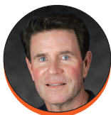
JIM PALMER , National Baseball Hall of Famer, Orioles Legend, and MASN Broadcaster

“It is all about habits — good and bad. Establish good habits when you are young. Eat healthy, exercise regularly, and choose not to use tobacco. Bad habits are difficult to change, so it’s best not to start down the wrong path.”