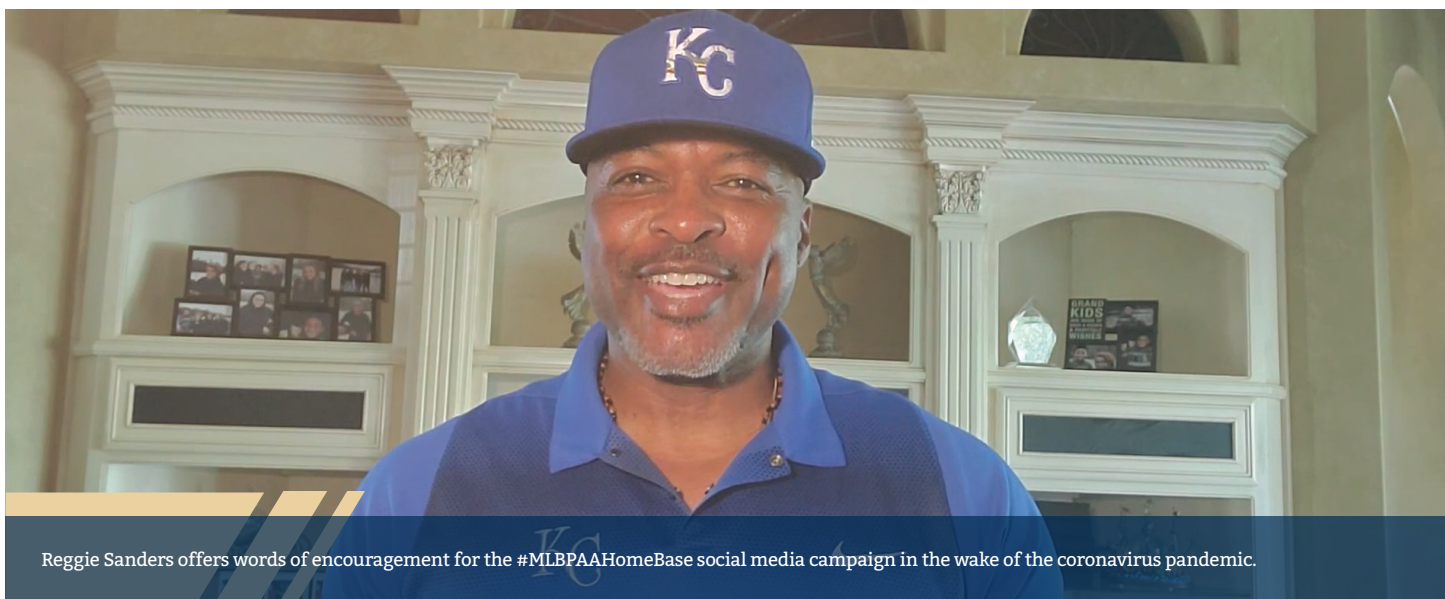
Reggie Sanders offers words of encouragement for the #MLBPAAHomeBase social media campaign in the wake of the coronavirus pandemic.

S eemingly overnight, our world changed. Our favorite restaurants closed their doors; our grocery stores limited the number of people who could enter the building at a time; our favorite sports were put on hold and we were advised to not leave our homes.