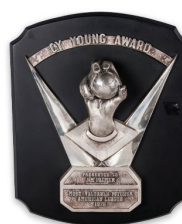
1976 Original Jim Palmer Cy Young Award (Palmer LOA)