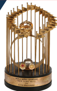
1986 Keith Hernandez Personally Owned New York Mets World Series Trophy