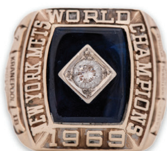
Ed Kranepool's 1969 New York Mets World Series Championship Player Ring (Kranepool LOA)

Goldin Auctions receives top dollar on player awards such as MVP, Gold Gloves, Silver Sluggers, Championship and All-Star Rings, Game-Used Bats, Jerseys, Balls and other baseball collectibles!