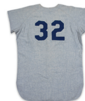
1963 Sandy Koufax Game Used and Signed Los Angeles Dodgers Road Jersey (MEARS A 9.5 & Beckett) Cy Young and MVP Season