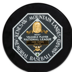
Andre Dawson's actual 1987 National League Most Valuable Player Award (Presented to and personally owned by Dawson)