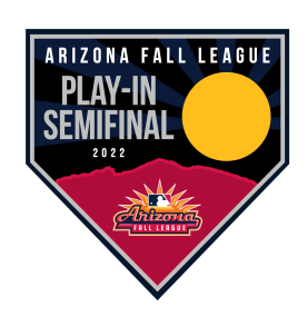
Friday, November 11 Peoria Sports Complex 6:35 p.m. MST