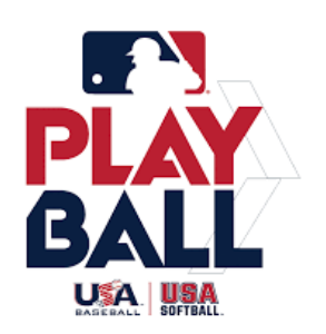
Play Ball Free Kids Event