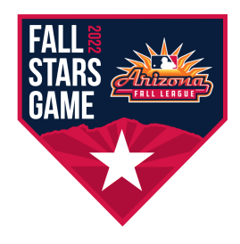
Sunday, November 6 Sloan Park