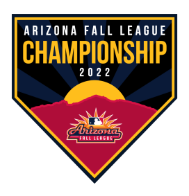
Saturday, November 12 Scottsdale Stadium