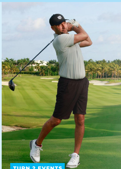
TURN 2 EVENTS