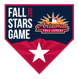
Sunday, November 6 Sloan Park 5:00 p.m. MST

Saturday, November 5 Sloan Park 6:35 p.m. MST