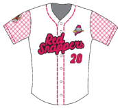
Red Snappers 1-0