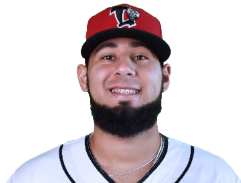
four-seam fastball, change-up, curve, slider

Signed ..... by Tampa Bay, June 1, 2016 Acquired ..... via trade, July 9, 2022 Bats / Throws ..... Right / Right