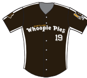
Whoopie Pies 1-0