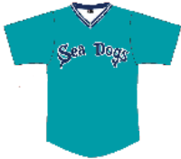
Throwback Teal 2-0