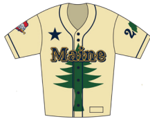
Maine Strong 1-0