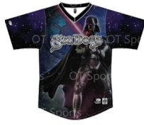
Star Wars 1-0