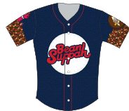
Bean Suppahs 1-0