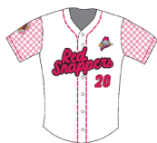
Red Snappers 1-0