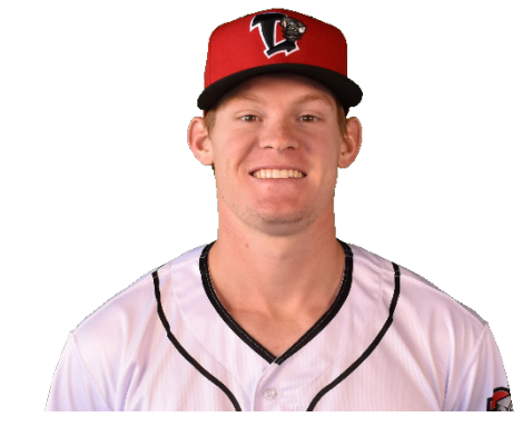
fastball, cut fastball, change, curve

Draft Day: Basso was selected 494th overall in the 16th round of the 2019 draft from Oklahoma State... scout: Chris Reilly... signed for $75,000... in the same round, two all-name players were drafted: the Tigers selected Kona Quiggle and the Blue Jays took Jackxarel Lebron... one of eight OSU Cowboys to be drafted in 2019..