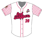
Red Snappers 1-0