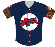
Bean Suppahs 1-0