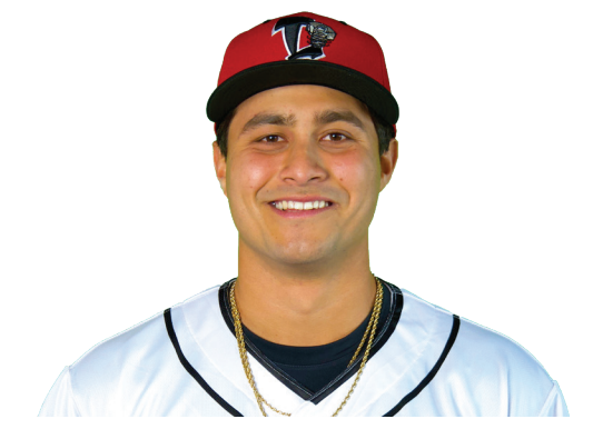
4-seam fastball, 2-seam fastball, slider, sweeper, change-up

Minor League Path: Made pro debut in the Arizona Complex League in 2022 with a pair of scoreless innings, moving up to Stockton for two relief appearances by year's end... spent all of 2023 with the Ports, serving as their relief ace (11 saves in 15 chances) and only allowing three home runs in 61 1/3 innings... limited left-handed batters to .198 batting average / .530 OPS; right-handers hit .305 with .753 OPS.