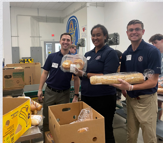
(Top) Packing school supplies for Foster Angels of Central Texas in June; (Bottom Left) Setting up Holiday Drive in December; (Right) Volunteering at Central Texas Food Bank