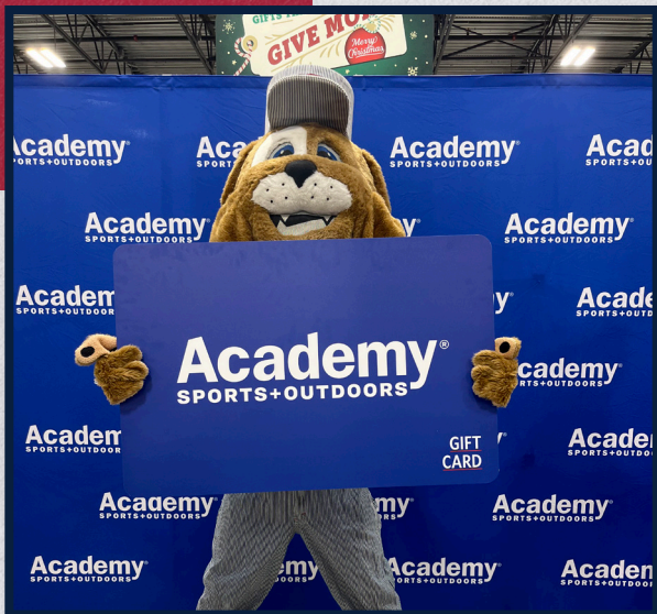
Spike at the Academy Grand Opening in Hutto