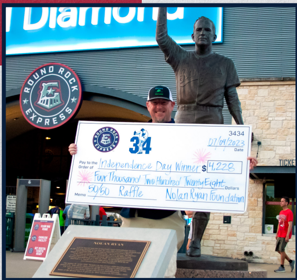
Independence Day 50/50 Raffle winner