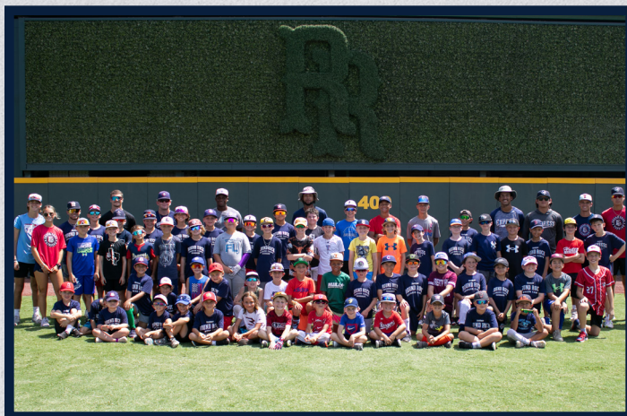
Group photo from the July Full-Day Express Camp

Dell Diamond hosted the Texas High School Baseball Coaches Association (THSBCA) All-Star games and the CenTex All-Star game. Over 80 players , all from different schools, participated in the THSBCA All-Star games.