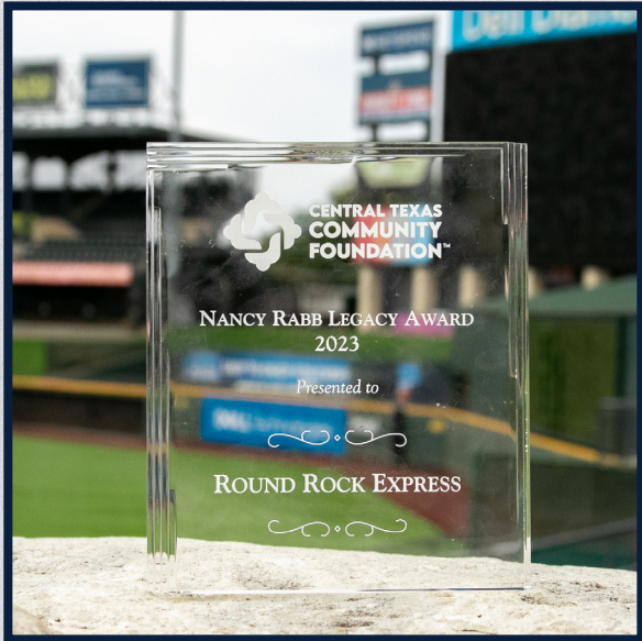
2023 Nancy Rabb Legacy Award