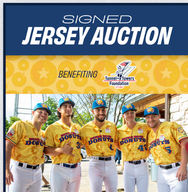
Round Rock Donuts game-worn autographed jersey auction benefiting the Tunnel to Towers Foundation, through the Nolan Ryan Foundation

The Express hosted five auctions through the Nolan Ryan Foundation benefiting the Austin Film Society, Latinos in Round Rock, Hope Alliance and the Tunnel to Towers Foundation. In 2023, the Express, through the Foundation, raised over $13,500 from auctions for these organizations.