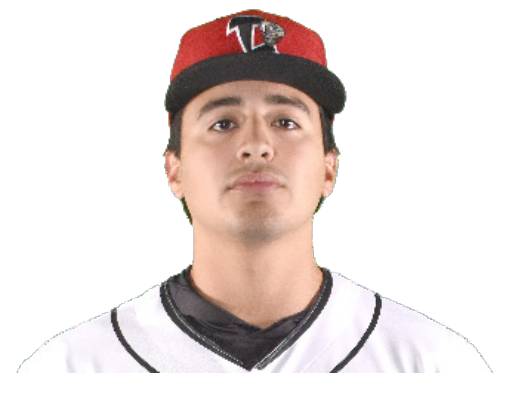
fastball, curve, change-up, slider

Bagels in April: Opened 2023 as the Ports' No. 4 starter, firing four scoreless innings at Fresno on April 11... that was the start of three consecutive scoreless outings to begin the year, finishing April with 13 2/3 scoreless innings... didn't allow first run until May 3 vs. Fresno, entering in relief in the fifth inning and allowing two runs in the fifth and two more in the seventh in a 5-4 Ports win... in total with Stockton, posted a 2.42 ERA with a .132 average against in five road starts (22 1/3 IP) compared to 4.24 ERA, .200 avg. in four home appearances (17 IP)... lefties hit .111/.243/.175 compared to righties' .205/.279/.308... base stealers went 2-for-2.