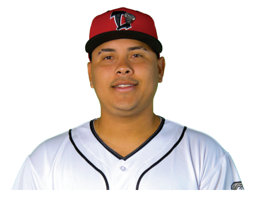
4-seam fastball, 2-seam fastball, cut fastball, slider, change-up