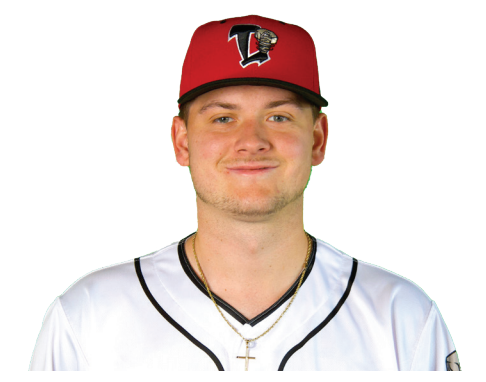
four-seam, two-seam, curve, change-up

Off to College: Did not receive much notice before his high velocity was discovered at a tryout in Morgantown... named to the Academic All-Big 12 Rookie Team as a freshman (5 G, 4.70 ERA, 7 2/3 IP, 4 R, 6 BB, 11 K)... as a sophomore, made 19 appearances: 3.33 ERA, 27 IP, 15 H, 11 R, 32 BB, bullpen-leading 53 K, .165 avg. allowed, tied for team lead with four saves; named Academic All-Big 12 Second Team; NCBWA Stopper of the Year Midseason Watch List... made first college start in the 2021 Big 12 Championship vs. Texas: 3 IP, 0 H, 1 R, 4 BB, 8 K... as a junior in 2022, named preseason All-American; dominated early as team closer and was moved into role as Friday starter; struck out 15 Texas Longhorns in 6 1/3 IP on May 7; overall: 18 G, 11 GS, 3-7, 6.22 ERA, 59 1/3 IP, 64 H, 44 R, 41 BB, 75 K; named All-Big 12 Honorable Mention.