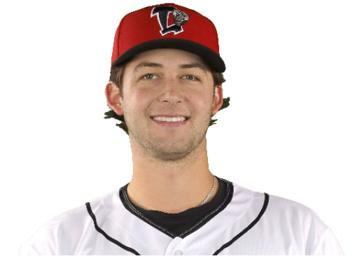
four-seam fastball, change-up, curve, slider

2022 Professional Debut: After signing for $125,000 as the Athletics' 12th-round selection in 2021, did not appear in a Minor League game until 2022, spent entirely with Stockton... led Ports in starts (22, six more than the closest teammate), innings (124 1/3, 28 1/3 more innings than the closest teammate), and double plays (10)... worked seven innings five times, 6 2/3 innings once, 6 1/3 innings twice, and six innings four times: 12 starts of 22 starts lasting at least six innings... struggled in 12 games, 11 starts, at home (7.11 ERA, .304 avg, 16 HR, in 57 innings) compared to 11 starts on the road (4.14 ERA, .269, 10 HR in 67 1/3 innings)... lefties and righties hit nearly identically: .286/.355/.536 for lefties, .285/.339/.525 for righties, though righties hit 17 of the 26 home runs allowed... struggled mightily in first innings, allowing .353/.402/.627 slash line and six home runs... opposing base stealers swiped 10 bases in 16 attempts.