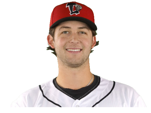
four-seam fastball, change-up, curve, slider

2022 Professional Debut: After signing for $125,000 as the Athletics' 12th-round selection in 2021, did not appear in a Minor League game until 2022, spent entirely with Stockton... led Ports in starts (22, six more than the closest teammate), innings (124 1/3, 28 1/3 more innings than the closest teammate), and double plays (10)... worked seven innings five times, 6 2/3 innings once, 6 1/3 innings twice, and six innings four times: 12 starts of 22 starts lasting at least six innings... struggled in 12 games, 11 starts, at home (7.11 ERA, .304 avg, 16 HR, in 57 innings) compared to 11 starts on the road (4.14 ERA, .269, 10 HR in 67 1/3 innings)... lefties and righties hit nearly identically: .286/.355/.536 for lefties, .285/.339/.525 for righties, though righties hit 17 of the 26 home runs allowed... struggled mightily in first innings, allowing .353/.402/.627 slash line and six home runs... opposing base stealers swiped 10 bases in 16 attempts.