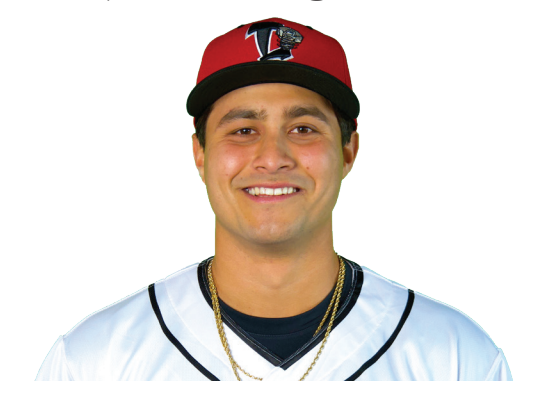
4-seam fastball, 2-seam fastball, slider, sweeper, change-up

Minor League Path: Made pro debut in the Arizona Complex League in 2022 with a pair of scoreless innings, moving up to Stockton for two relief appearances by year's end... spent all of 2023 with the Ports, serving as their relief ace (11 saves in 15 chances) and only allowing three home runs in 61 1/3 innings... limited left-handed batters to .198 batting average / .530 OPS; right-handers hit .305 with .753 OPS.