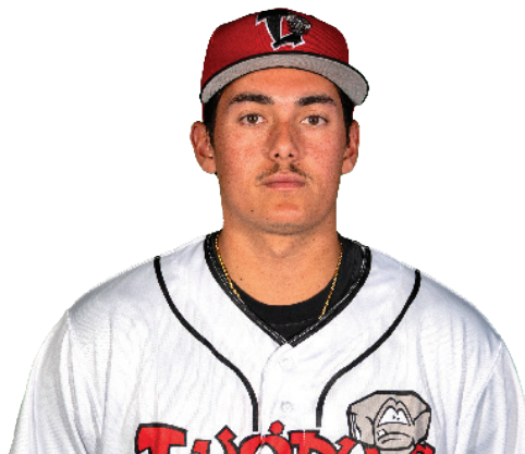
fastball, slider, curve, change-up