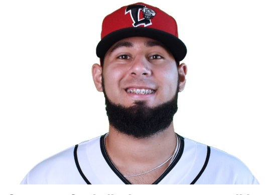
four-seam fastball, change-up, curve, slider

Path Through the Pros: Debuted in 2016 in Dominican Summer League working entirely out of the bullpen... converted to starting pitcher in 2017 DSL with greater success... split 2018 between DSL and Gulf Coast League... spent 2019 in Appalachian League... missed 2020 (canceled MiLB season) and 2021 (injury).