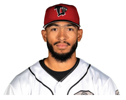
fastball, sinker, sweeper, splitter