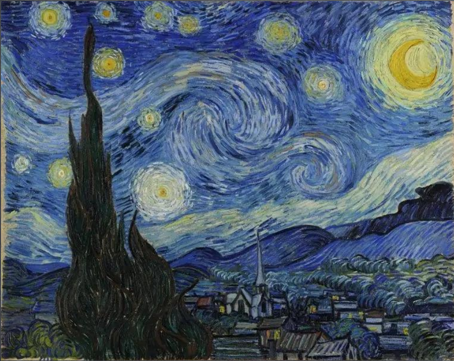
Modern Art Example "Starry Night" – Vincent van Gogh