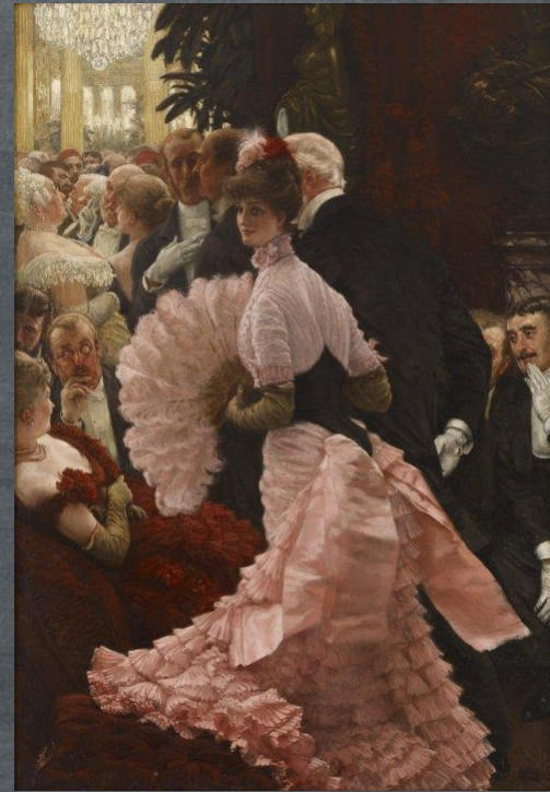
Contemporary Art Example "Political Woman" – James Tissot