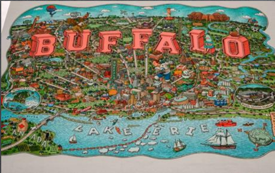
“Buffalo Map” – Mario Zucca