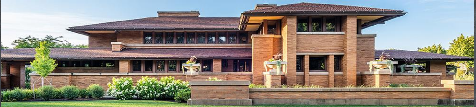
The Martin House