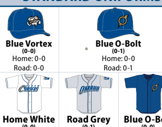
Road Grey (0-1) Home: 0-0 Road: 0-1