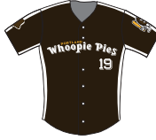
Whoopie Pies 1-0