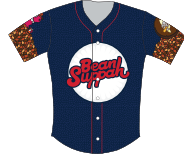
Bean Suppahs 1-0