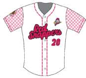
Red Snappers 1-0