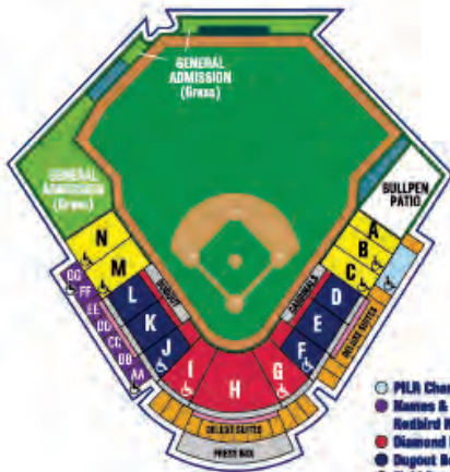
HAMMONS FIELD Springfield, Missouri