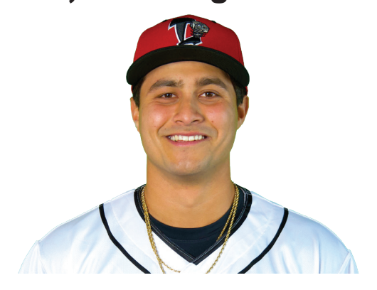
4-seam fastball, 2-seam fastball, slider, sweeper, change-up

Minor League Path: Made pro debut in the Arizona Complex League in 2022 with a pair of scoreless innings, moving up to Stockton for two relief appearances by year's end... spent all of 2023 with the Ports, serving as their relief ace (11 saves in 15 chances) and only allowing three home runs in 61 1/3 innings... limited left-handed batters to .198 batting average / .530 OPS; right-handers hit .305 with .753 OPS.