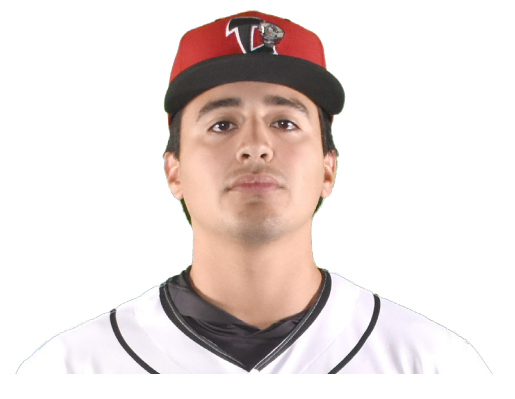
fastball, curve, change-up, slider

Bagels in April: Opened 2023 as the Ports' No. 4 starter, firing four scoreless innings at Fresno on April 11... that was the start of three consecutive scoreless outings to begin the year, finishing April with 13 2/3 scoreless innings... didn't allow first run until May 3 vs. Fresno, entering in relief in the fifth inning and allowing two runs in the fifth and two more in the seventh in a 5-4 Ports win... in total with Stockton, posted a 2.42 ERA with a .132 average against in five road starts (22 1/3 IP) compared to 4.24 ERA, .200 avg. in four home appearances (17 IP)... lefties hit .111/.243/.175 compared to righties' .205/.279/.308... base stealers went 2-for-2.