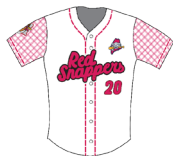
Red Snappers 1-0