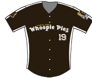
Whoopie Pies 1-0