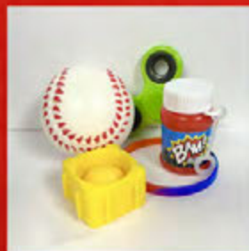
Sensory Pack $10.00