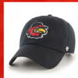
47 Brand Home Adjustable Cap $30.00

MERCHANDISE IS PRICED PER ITEM AND CAN BE ORDERED INDIVIDUALLY. ITEMS WILL BE DELIVERED PRIOR TO GATE OPENING. ORDERS MUST BE PLACED FIVE (5) DAYS PRIOR TO YOUR EVENT.