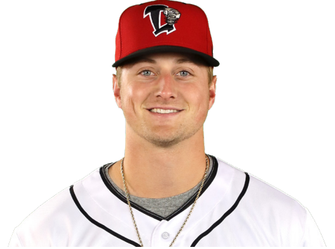
fastball, curve, change, cutter