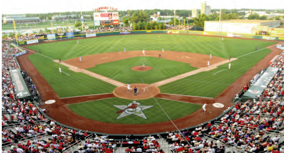
Directions to Hammons Field