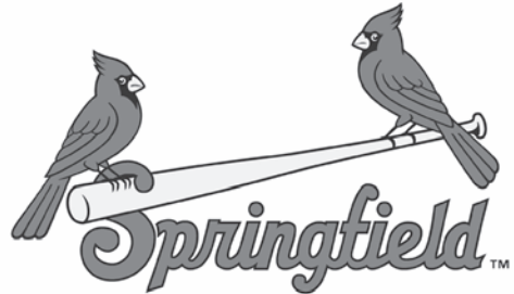
“Birds on the Bat Logo” Worn on the front of jerseys as the main logo