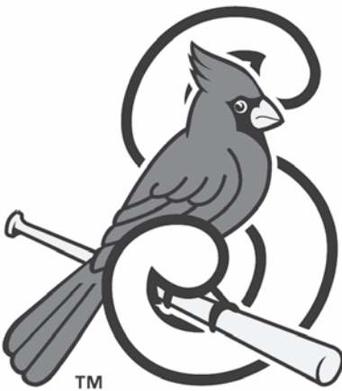
“S Logo” Worn on all hats and helmets