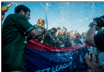
Loons celebrated their first MWL title in 2016.