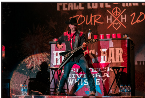
Big & Rich ('19)

Located in downtown Midland, Dow Diamond is more than just a stadium. A year-round facility with elegant rooms and unique views Dow Diamond turns any event into a memorable occasion. Dow Diamond's full-time catering department has extensive menus and drink options for parties of 25 to over 1,000. With a management staff experienced in executing events of all sizes, Dow Diamond's special events deliver exceptional results from concept to finish. To reserve your spot for a trade shows, celebrations, charity events, graduation parties and more, contact Dave Gomola by calling 989.837.6146 or emailing dgomola@loons.com .