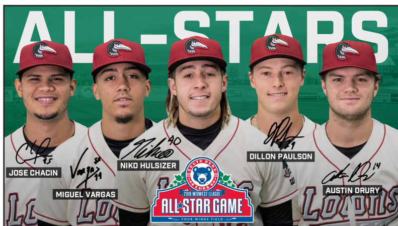
Loons' 2019 Midwest League All-Stars.