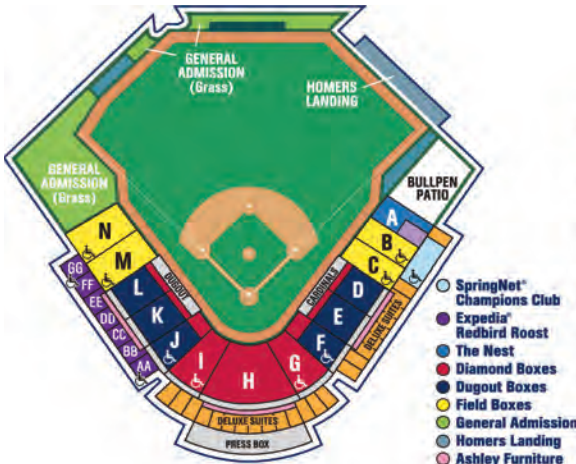
HAMMONS FIELD Springfield, Missouri