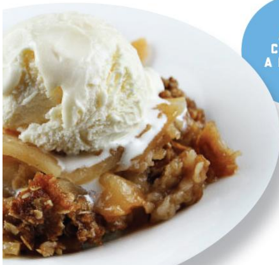
APPLE COBBLER A LA MODE

*Items must be ordered 24 hours in advance.