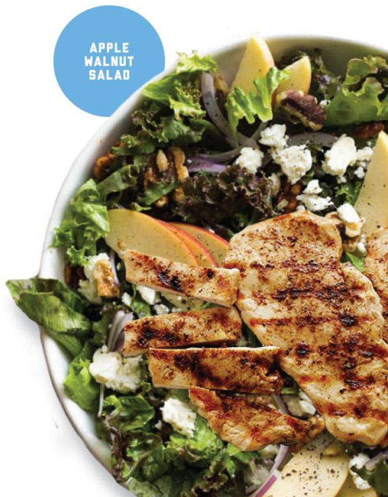
APPLE WALNUT SALAD