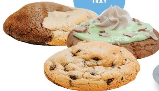
COOKIE CO. TRAY