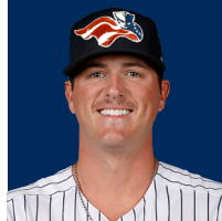
PROSPECT RANKINGS 2019 MLB Pipeline #29 Yankees Prospect