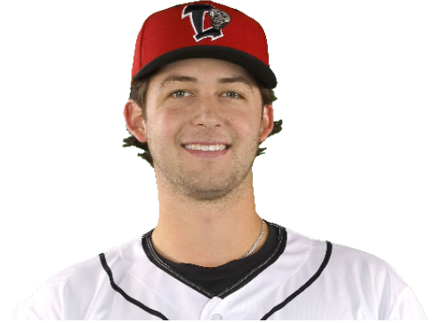
four-seam fastball, change-up, curve, slider

School ..... University of Pittsburgh Acquired ..... 368th overall, 12th round, 2021 Bats / Throws ..... Right / Right