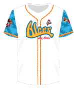
Alces de Maine