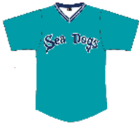
Throwback Teal 0-1