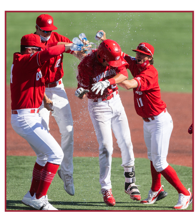
Eden getting doused after a walk-off single May 16 versus Spokane