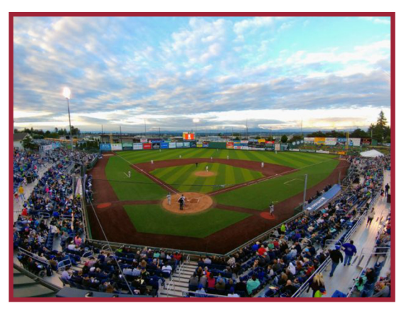
Funko Field - Everett, WA

The Everett AquaSox are the Advanced-A affiliate of the Seattle Mariners. They play their home games at Funko Field in Everett, WA, 30 minutes north of Seattle. The franchise traces its history back to the Walla Walla, WA-based Blue Mountain Bears, who moved to Everett in 1984 and became the Everett Giants as San Francisco's Short-Season affiliate before signing a Player Development contract with the Mariners in 1995. That same year, the team debuted its new name: the AquaSox.