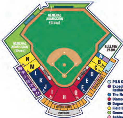
HAMMONS FIELD Springfield, Missouri