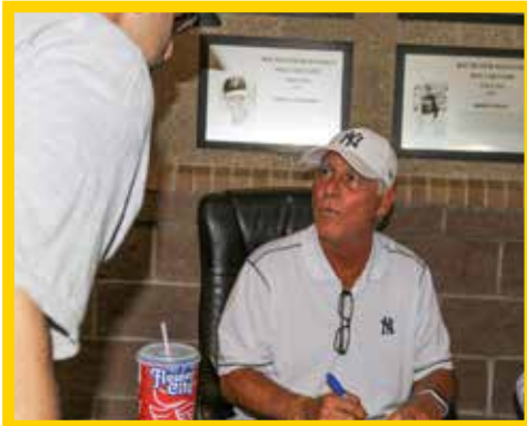
Former Yankees star Bucky Dent with a fan at a sponsored autograph and photo session.