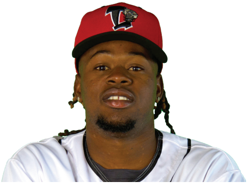
4-seam fastball, 2-seam fastball, slider, change-up

Twice Honored: Named the California League Pitcher of the Week on May 29-June 4 after tossing 7-inning, 1-hit gem vs. Modesto... named Pitcher of the Week again June 12-18 after tossing 7-inning, 2-hit gem at Lake Elsinore... from June 4-18, fired three consecutive seven-inning quality starts, allowing one total run on eight hits, seven walks, with 17 strikeouts.