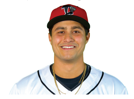
4-seam fastball, 2-seam fastball, slider, sweeper, change-up

Minor League Path: Made pro debut in the Arizona Complex League in 2022 with a pair of scoreless innings, moving up to Stockton for two relief appearances by year's end... spent all of 2023 with the Ports, serving as their relief ace (11 saves in 15 chances) and only allowing three home runs in 61 1/3 innings... limited left-handed batters to .198 batting average / .530 OPS; right-handers hit .305 with .753 OPS.