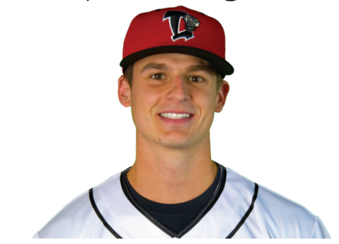
4-seam fastball, curve, sweeper, change

International Stage: With lowa, took part in the 2017 World University Games in Taipei City, winning a silver medal (fell to Japan in the gold medal contest)... part of the first American team to ever advance to the gold medal game as well as the first American team to ever medal, period... team finished 5-2, losing only to Japan... started five games, four at first base, one at pitcher.