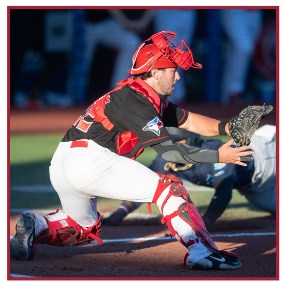
Gold making a play at home plate