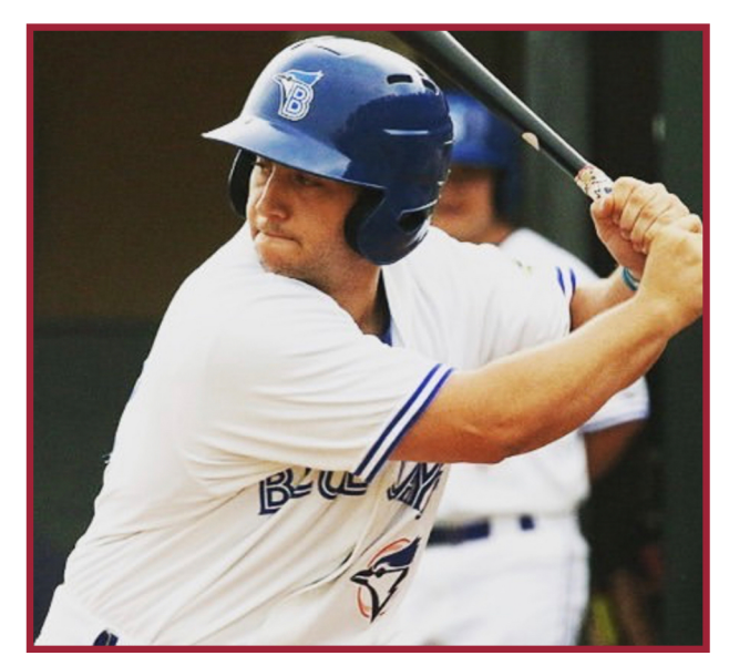
Gold with Bluefield in 2017

I'm very thankful for where I've been and how it's shaped me into the man I am today. You may not be where you want to be, but you're supposed to be where you're supposed to be. That mentality helps you stay in the moment and give you perspective. Once you get used to it, it makes everything a lot easier. The transition from place to place seems like nothing. Moving around a lot in my life helped me to get use to uncomfortable situations in pro